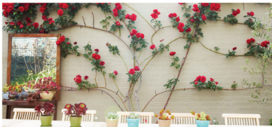
The climbing rose trained against the wall