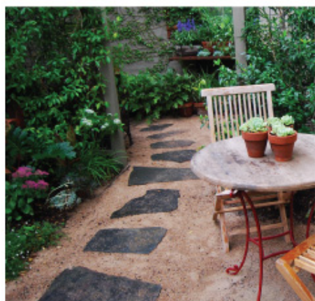
A shady place for all the favourite plants